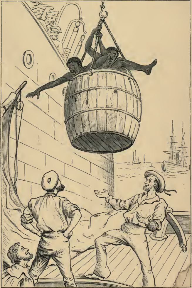
KAFIR NOBILITY.—PAGE 193.—Frontispiece.